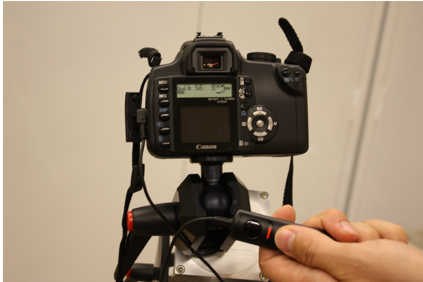
Figure 15: Push the slider up on the shutter control , exposing the red strip. Use the button to take the image. If in “bulb” mode, press again to close the shutter and save the image.