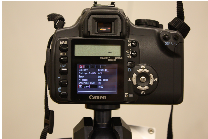
Figure 5: Press the Menu button to access the menu. Navigate with the arrows to the right of the screen; select with the middle button. There are several tabs within the menu. The first should have the following settings: Quality raw + smooth large, Red-eye off, AF mode one shot, Metering mode dot with above- and below-symbols, ISO speed 1600.