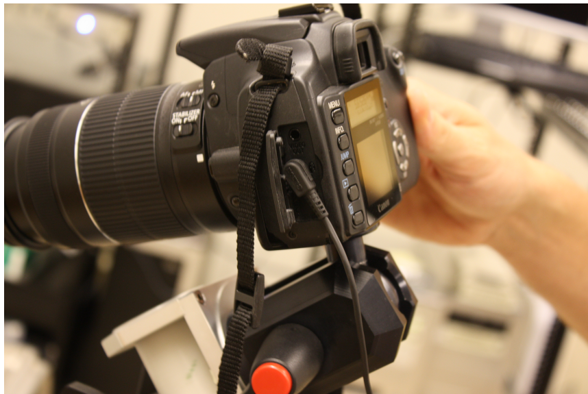
Figure 14: Plug the shutter control into the middle port on the left side of the camera.