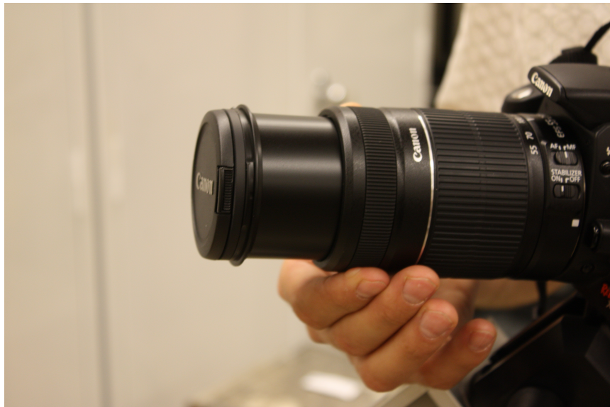
Figure 4: After deciding on the zoom, set the focus by rotating the smaller grip.