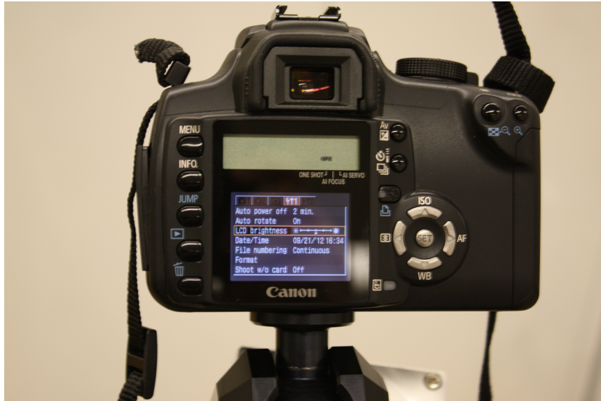
Figure 9: The important settings for the fourth menu tab are as follows: LCD brightness as dim as possible, Date/Time there's no harm in making sure these are correct, but it does not matter too much if you're careful to note when you took the images, Shoot without card off