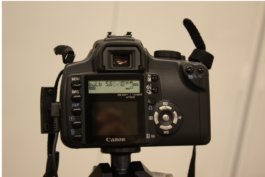
Figure 13: The exposure time and f -ratio settings you will probably want to use. The setting “bulb” means the exposure as an indefinite time. You will want to use this for long exposures. For focusing, you may want to set it to take fixed shorter lengths (e.g. 5 seconds). For anything longer than a second or two, you can always use “bulb,” unless you care about the exact timing of the exposure.