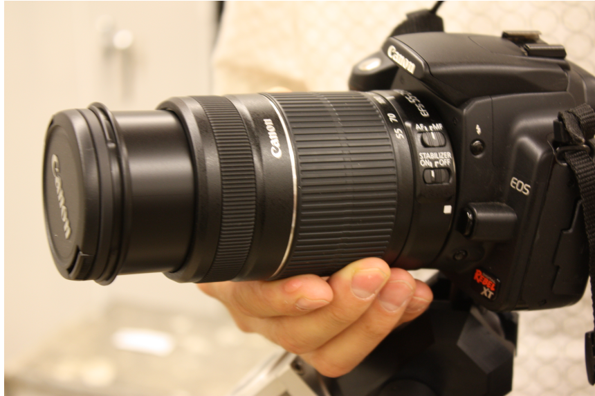
Figure 3: You can adjust the zoom by turning the large grip on the lens.