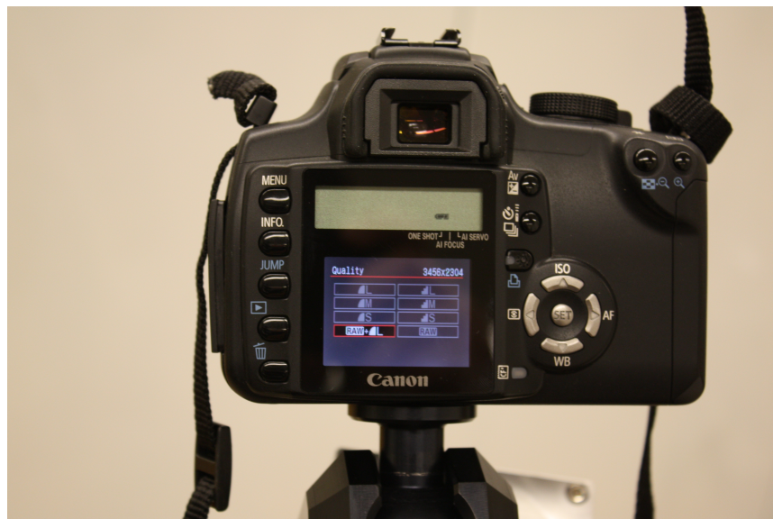
Figure 6: When you select a field (such as Quality in this picture) to change it, you may be brought to a new screen, where you can use the arrows to navigate. Press Menu at any time to leave a field without changing it, or to leave the entire menu.