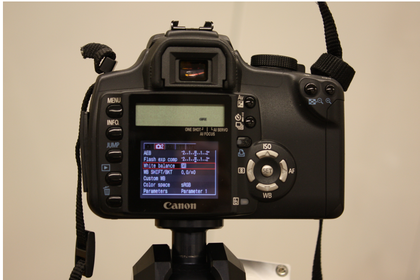
Figure 7: The settings for the second menu tab should be as follows: AEB and Flash exposure compensation 0 , White balance AWB , White balance shift 0 , Color space sRGB , Parameters Parameter set 1 (first three parameters halfway between neutral and maximum, last parameter neutral)