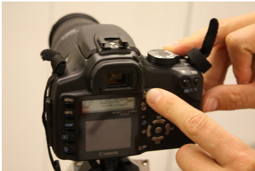
Figure 12: While pressing and holding the Av button just to the right of the top display, use the same wheel to change the f-ratio . The available range is dictated by the focus.