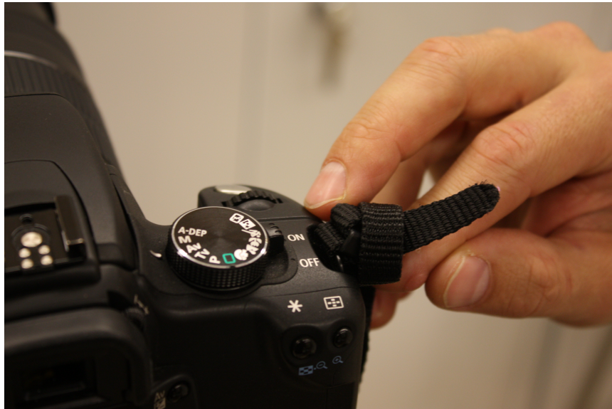
Figure 1: Turn the camera on with the switch on the top right. Set the mode to manual (M) using the dial.