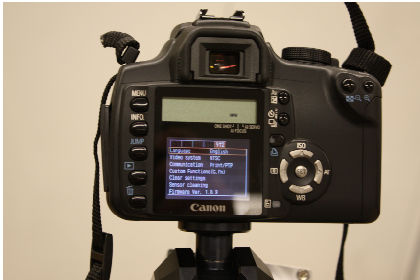
Figure 10: The settings for the fifth menu tab should not need to be adjusted.