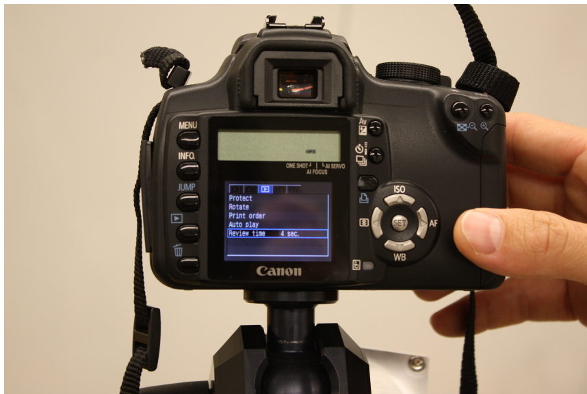
Figure 8: The settings for the third menu tab should not matter much, except you can adjust the review time to your liking.