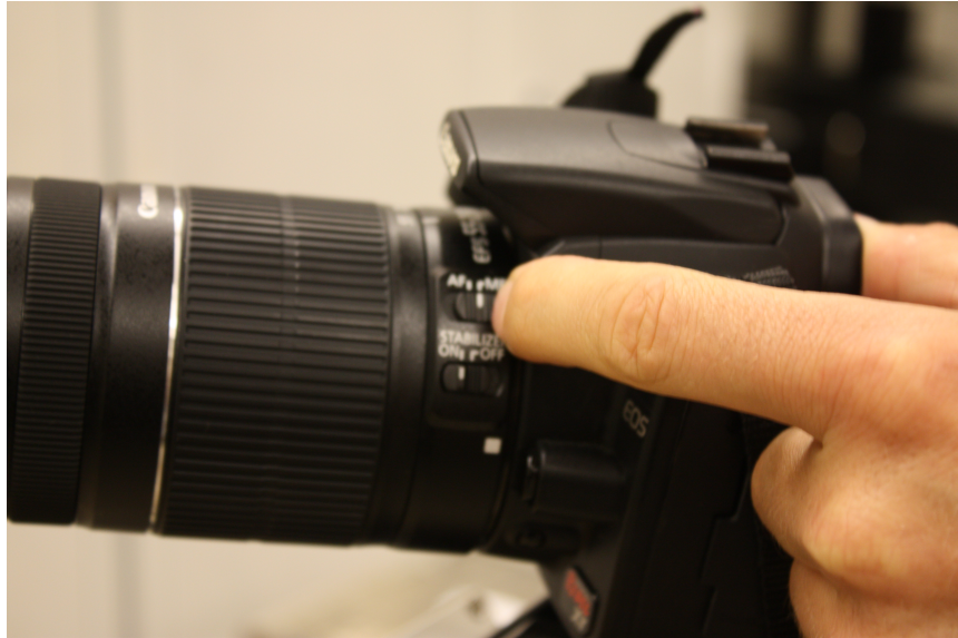
Figure 2: Set focus to manual (not automatic), and set stabilizer to off .