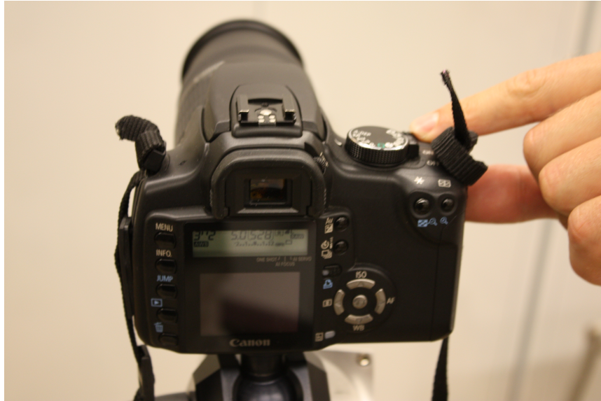
Figure 11: Use the wheel on the front right of the camera to adjust the exposure time (shown here as 3.2 seconds).